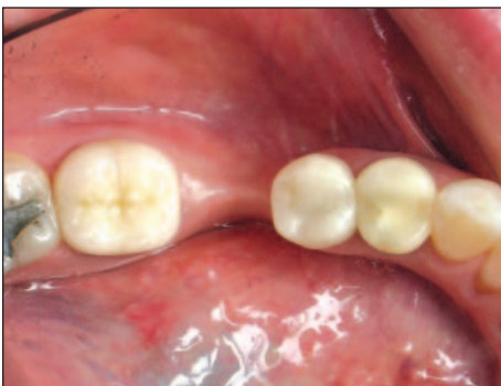
Figure 2. Severe alveolar ridge collapse has occurred one year following extraction. This likely could have been prevented with socket grafting at the time of tooth removal.