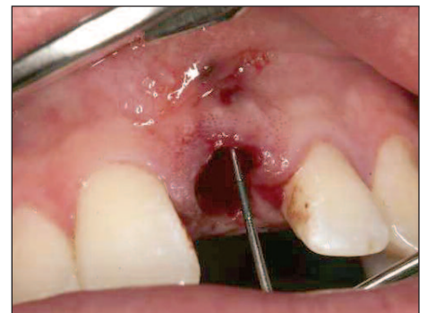
Figure 3. At the time of extraction, a fenestration in the buccal plate was found with a periodontal probe. (See Figures 4, 5 and 6 on page 3.)

Wound healing studies show that ungrafted sockets lose an average of 17 percent of horizontal dimension and 25 percent of vertical dimension. With socket grafting, the horizontal bone grew an