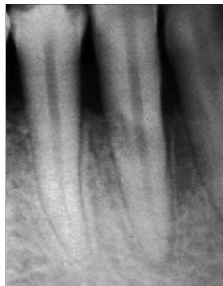
Figure 5. Six months following regenerative therapy, complete fill of the periodontal defect can be observed radiographically.