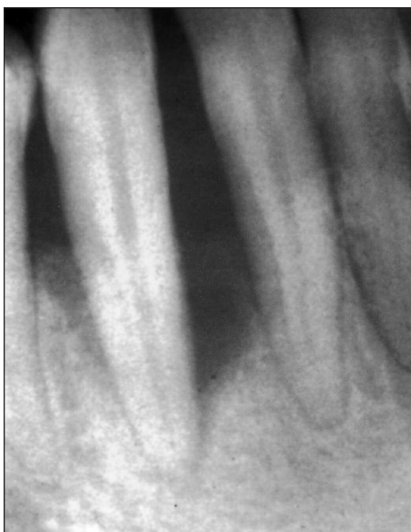
Figure 3. Most clinicians would be quick to remove the lower left canine which has severe bone destruction.

Caries. Decay which extends beyond or to the level of the alveolar bone usually represents a restorative challenge for the clinician and substantial treatment costs for the patient.